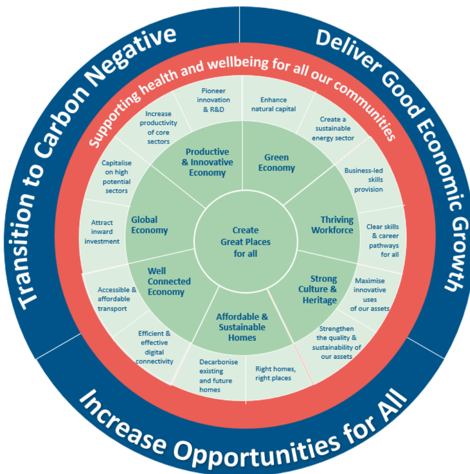
Figure 1: The Combined Authority’s Economic Framework